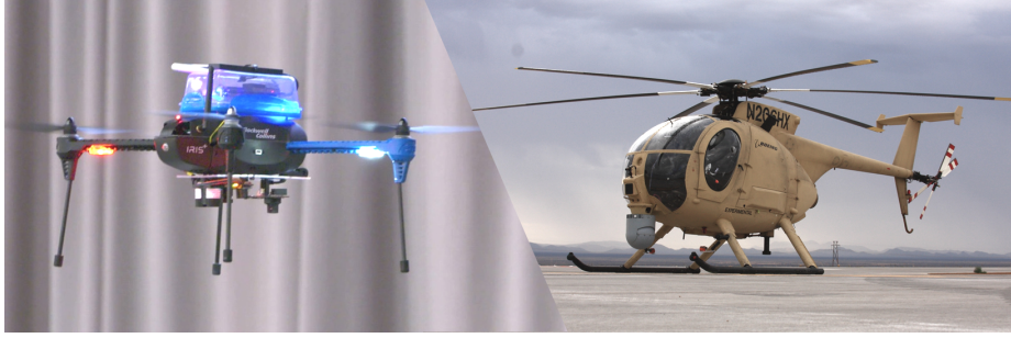
Fig. 1. Demonstration Aircraft: SMACCMcopter and Unmanned Little Bird

The airframe for the SMACCMcopter is the IRIS+ quadcopter produced by 3D Robotics. The IRIS+ uses a Pixhawk flight control computer which runs the hard real-time control software and includes integrated sensors for vehicle acceleration and attitude. A separate mission computer has been mounted on top of the IRIS+ body. The mission computer is based on an ARM Cortex-A15 CPU and communicates with the flight control computer over a CAN bus. It hosts functions for encryption/decryption, the CAN interface to the flight computer, and ground station communication. To demonstrate mixed-security architectures involving commercial software, the camera software represents an untrusted component that runs in a Linux virtual machine (VM) hosted by seL4. It receives video data from the camera, detects and computes bounding boxes for objects of a specified color, and sends video data to the ground station.